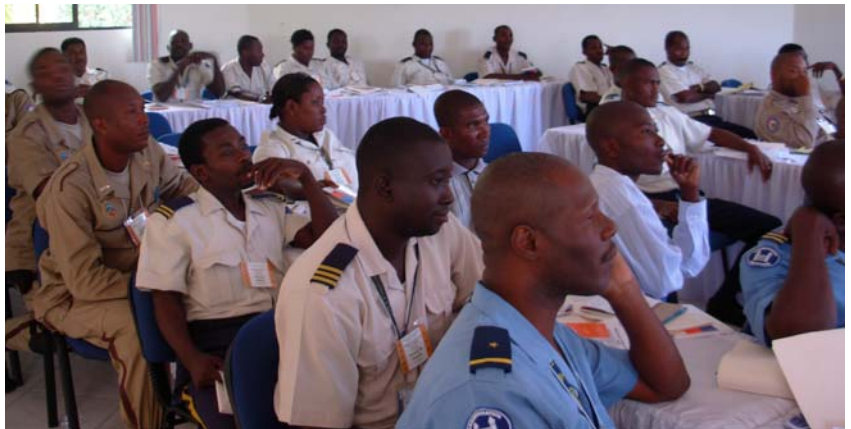
Police officers attentively following a human rights training session in Mirebalais.

This is the second training for PNH officers after the South-East department and is just one aspect of RNDDH's larger human rights training program.