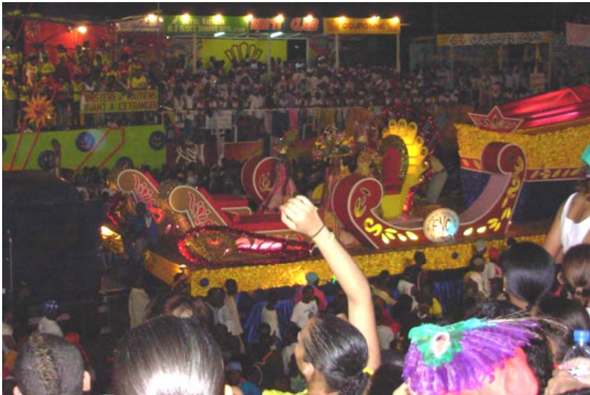
Crowds gathered to celebrate Carnival “Soley Leve”

M usic, colors, costumes, crowds – for the 3 days of “gras”, February 18-20 2007, many gathered in Champ Mars for Haiti’s largest cultural celebration. This year’s carnival theme was “Soley Leve” (the sun rises).