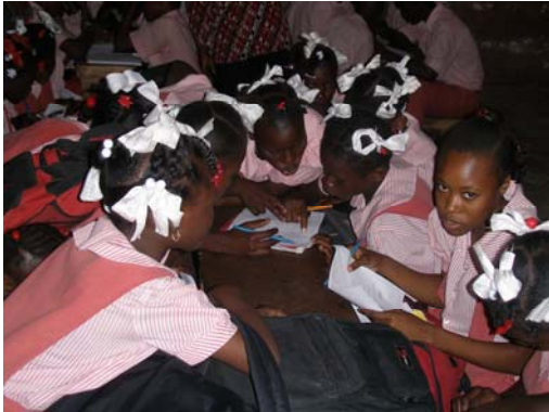
A group of students from the North test their knowledge in human rights.