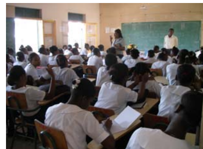
A session of Education Plus in the North department

In general, the students were very attentive. Many among them retained information relating to the first training session. At the end of the second workshop, which builds on the concepts learned in the first workshop,