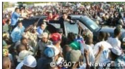
Crowds gather to greet President Chavez

On March 13, 2007, the Venezuelan President Hugo Chavez and the Vice President of Cuba spent a couple of hours in Port-au-Prince. Chavez was warmly welcomed at the airport by thousands of demonstrators, most of who were Lavalas supporters. During the visit, an accord on health, energy and gas was signed by the representatives of the three countries, which was followed by a press conference at the National Palace. According to President René Préval, this accord is not based on interests (supporter/debtor). It is based on the supply of 14,000 barrels of gas each day from Venezuela under "Pétrocaribe" program; as well as the arrival of Cuban and Venezuelan technicians for the construction of three central electrical power stations with a capacity of 40 megawatts to be located in Gonaives, Cap-Haitien, and Port-au-Prince; and finally a humanitarian fund to the sum of 21 million dollars, created by Venezuela for Haiti's benefit. These funds will aid in the acquisition of medical equipment and lodging of new Cuban doctors which will be sent to Haiti.