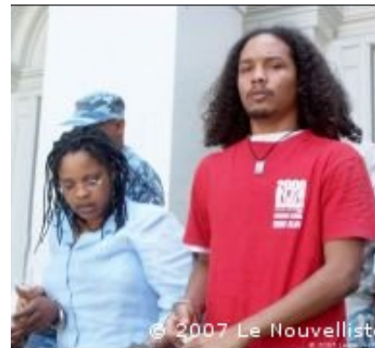
Two accused persons leaving the Courthouse of Port-au-Prince