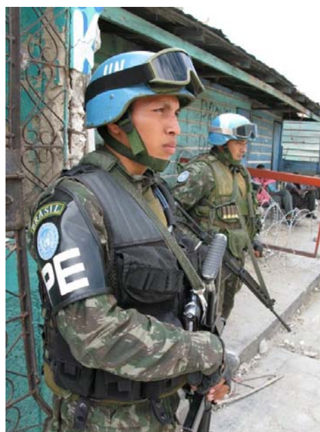
UN soldiers before an operation in Cité Soleil