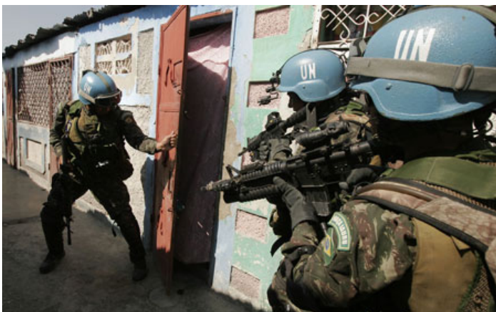
MINUSTAH soldiers during an intervention in Cité Soleil