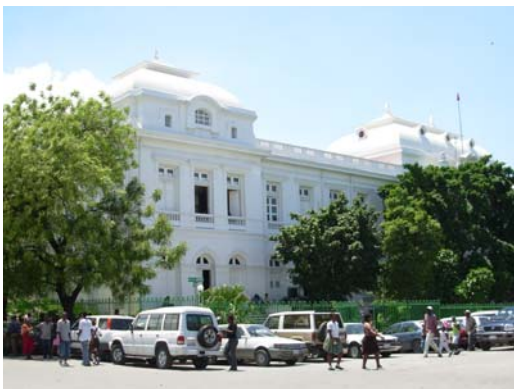
The Courthouse of Port-au-Prince

The criminal trial sessions have proved to be one of the most efficient ways to manage the epidemic of extended pre-trial detention which clogs the prisons of the country.